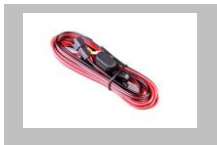
Charging cable (Standard)